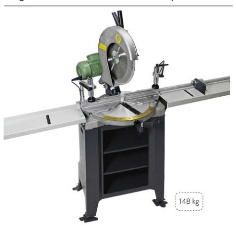
HA 1010 Single Head Saw-Pneumatical Clamp