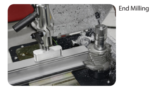
Cutter Change System: Practical cutter change system provides ease of operation.